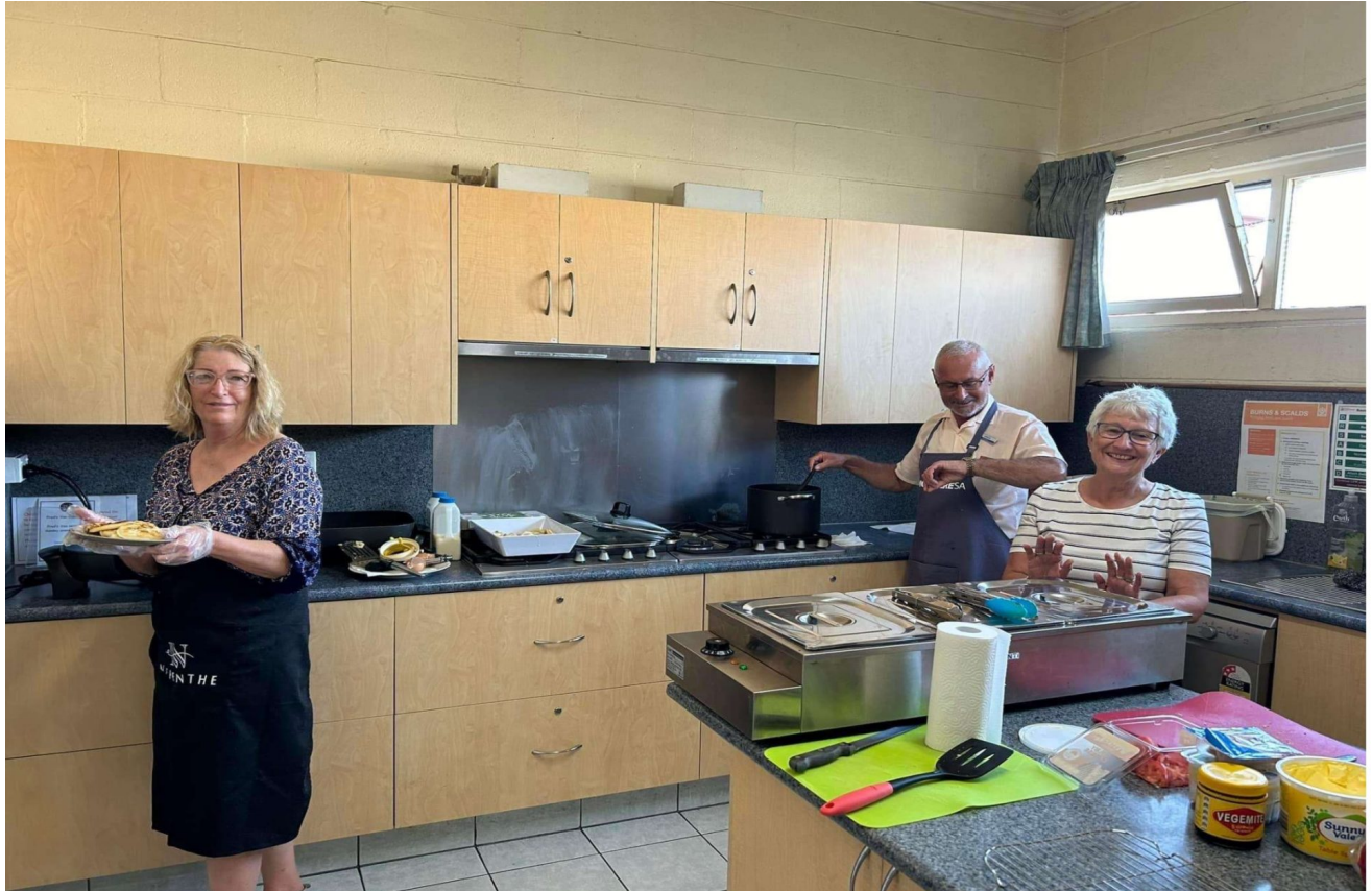
Volunteers prepare breakfast at St Bede's

People in need can eat, take food and other donated items away, enjoy the company of others and make friends. Chair yoga is offered.