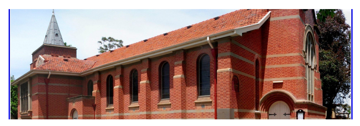
All Souls, St Peters celebrates 140 years

All Souls church in St Peters has marked 140 years of ministry at its Patronal Festival on Sunday 5 November with the regular congregation joined by many members of the wider community to celebrate the long community history.