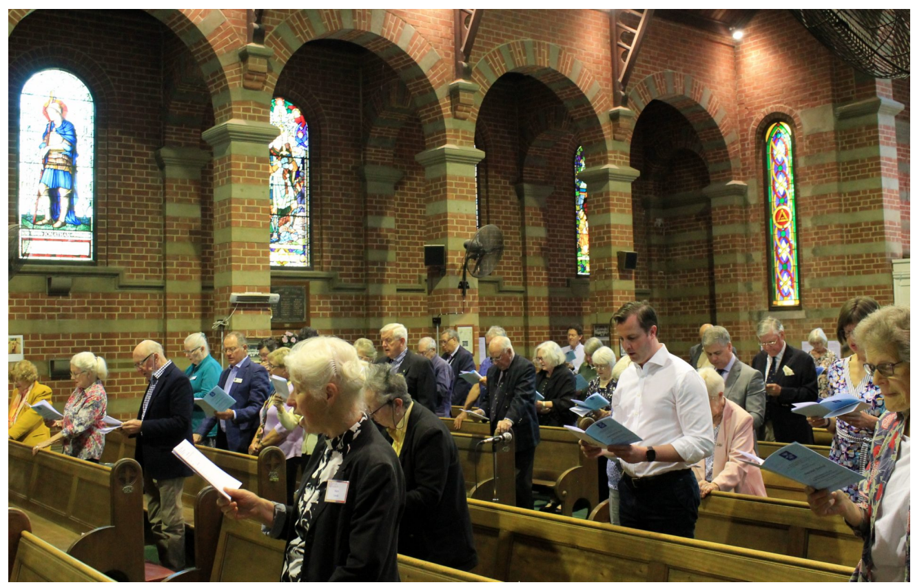
The congregation celebrates 140 years of All Souls, St Peter's ministry.