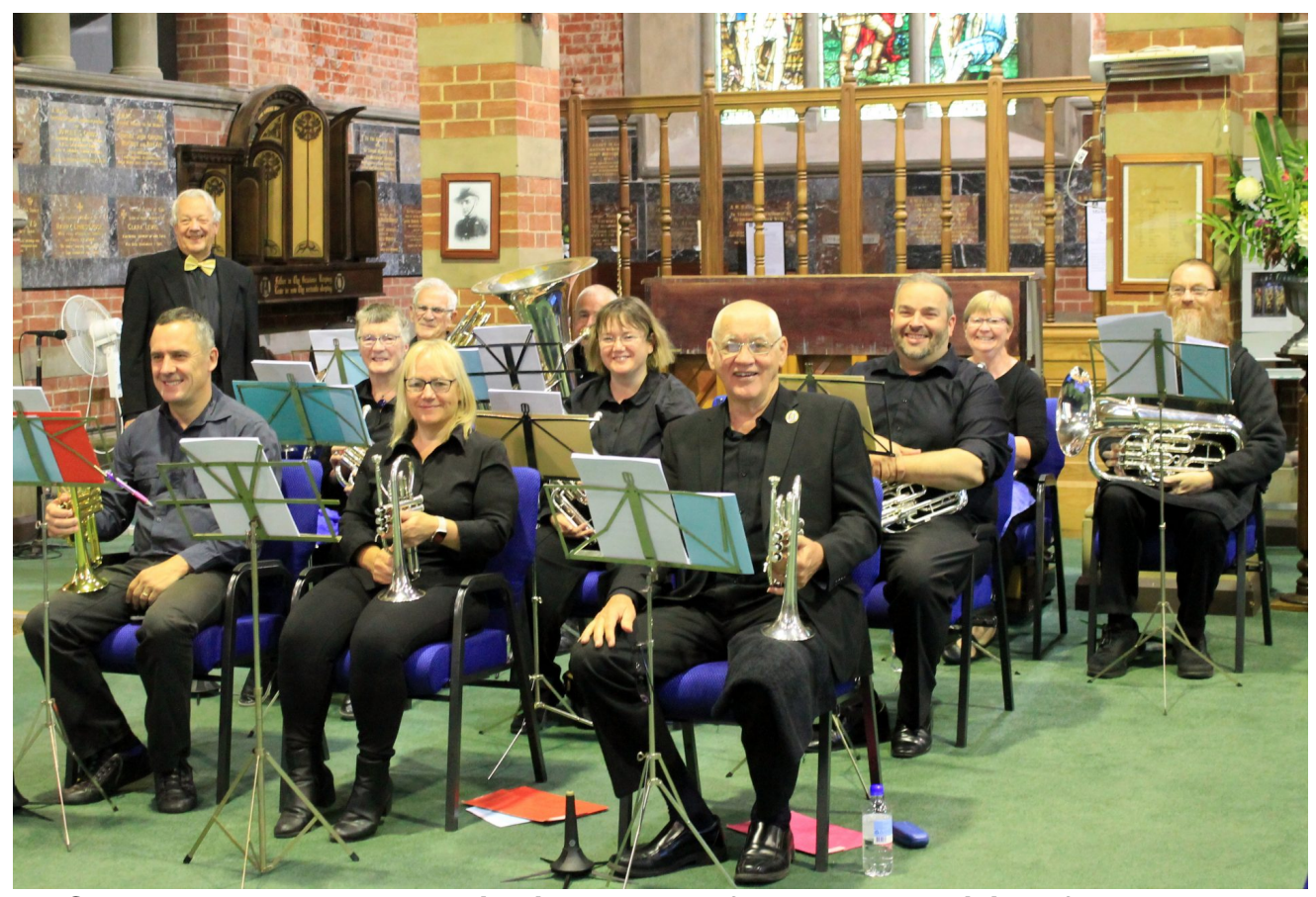
All Souls' Brass Ensemble, which is made up of volunteer musicians from several brass bands including Campbelltown City Brass Band.

"I don't know about you, but as a child when I heard talk of Heaven, Hell, and Purgatory it was certainly distressing.