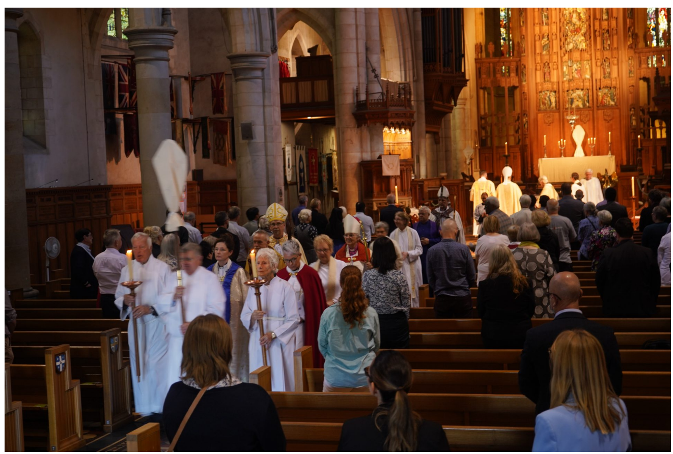
Procession at the end of the 2024 Chrism Eucharist