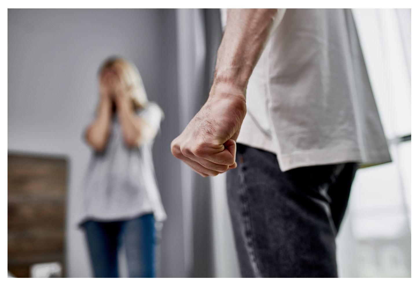
The confronting evidence of family violence and the Church