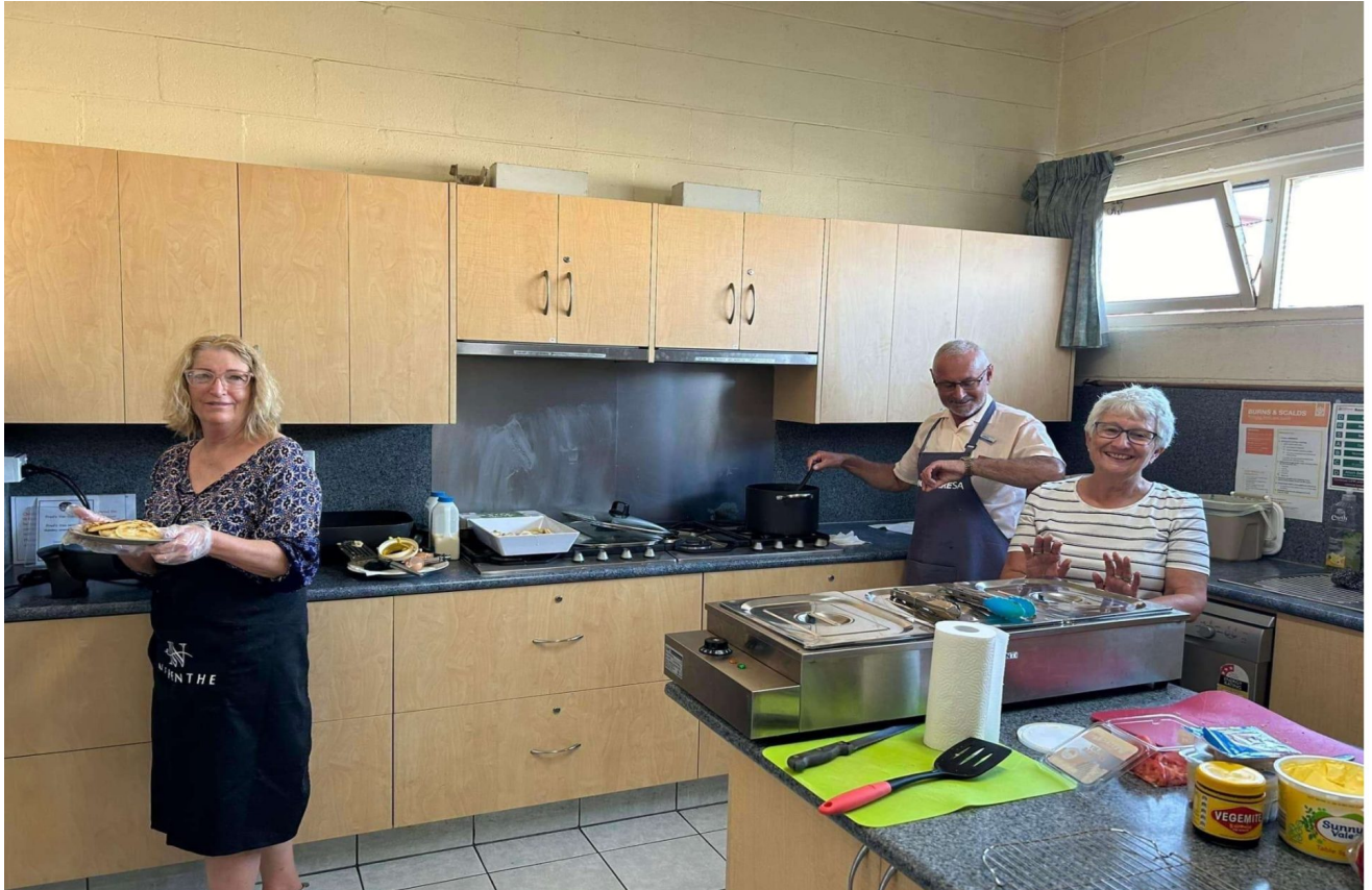
Volunteers prepare breakfast at St Bede's

People in need can eat, take food and other donated items away, enjoy the company of others and make friends. Chair yoga is offered.