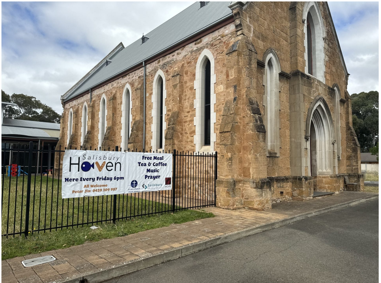
A new banner advertises the community meal at Salisbury Parish with numbers attending now around 80 a week.

Every Friday, from 5:30pm to 9:00pm at St. John's Anglican Church in Salisbury, we offer a free but good quality meal to feed between 60 and 80 people. I collaborate with pastors and team leaders from various denominations. The volunteers number around 20 people who are very committed.