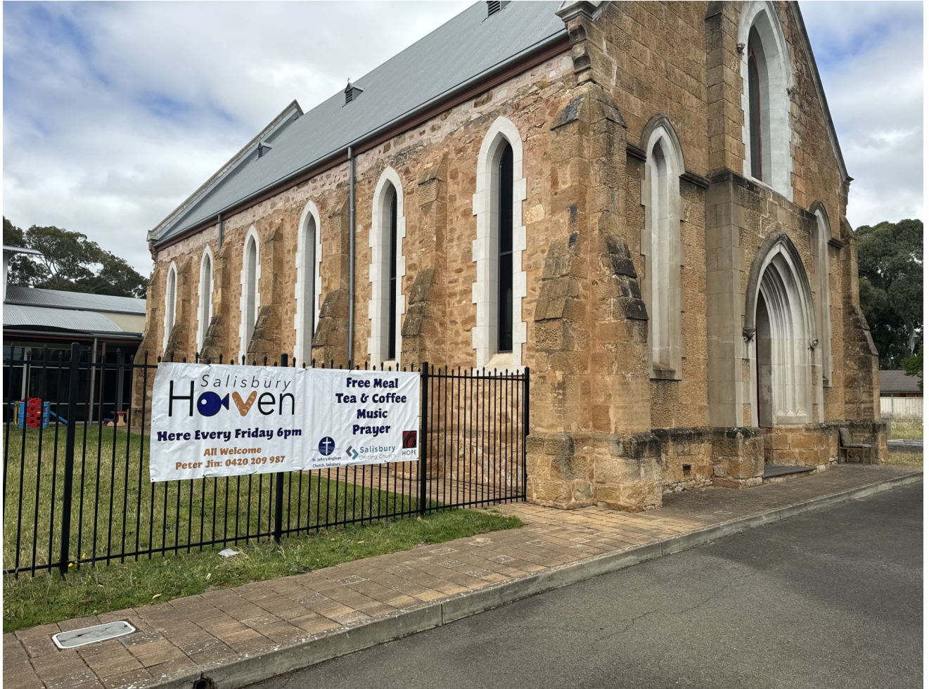
A new banner advertises the community meal at Salisbury Parish with numbers attending now around 80 a week.