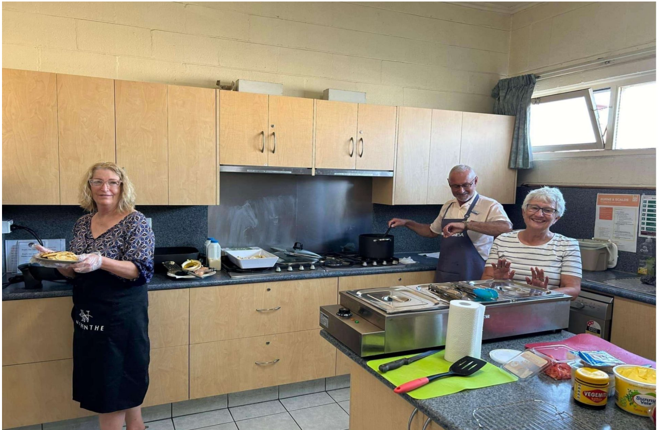
Volunteers prepare breakfast at St Bede's

People in need can eat, take food and other donated items away, enjoy the company of others and make friends. Chair yoga is offered.