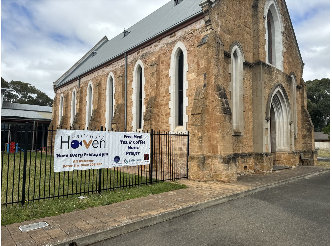
A new banner advertises the community meal at Salisbury Parish with numbers attending now around 80 a week.