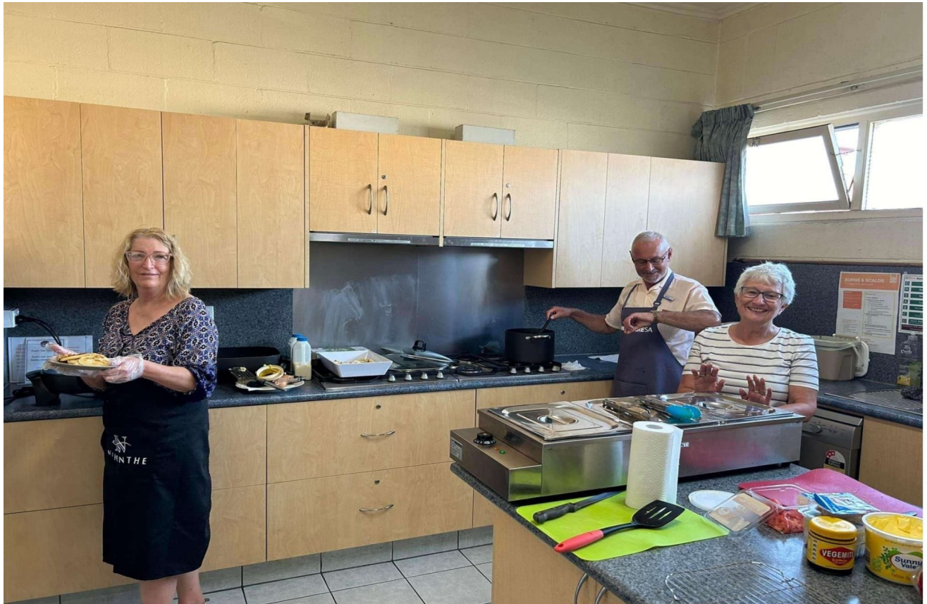
Volunteers prepare breakfast at St Bede's

People in need can eat, take food and other donated items away, enjoy the company of others and make friends. Chair yoga is offered.