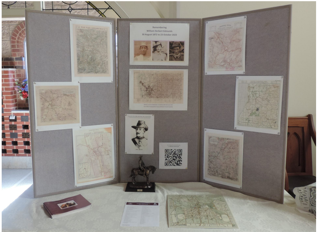
A display of mapmaker WH Edmunds' work in the chapel at North Road Cemetery

Together with Carolyn Spooner from the State Library of South Australia, we refurbished his gravesite, adding both a brass plaque and a ceramic plaque giving details of his work.