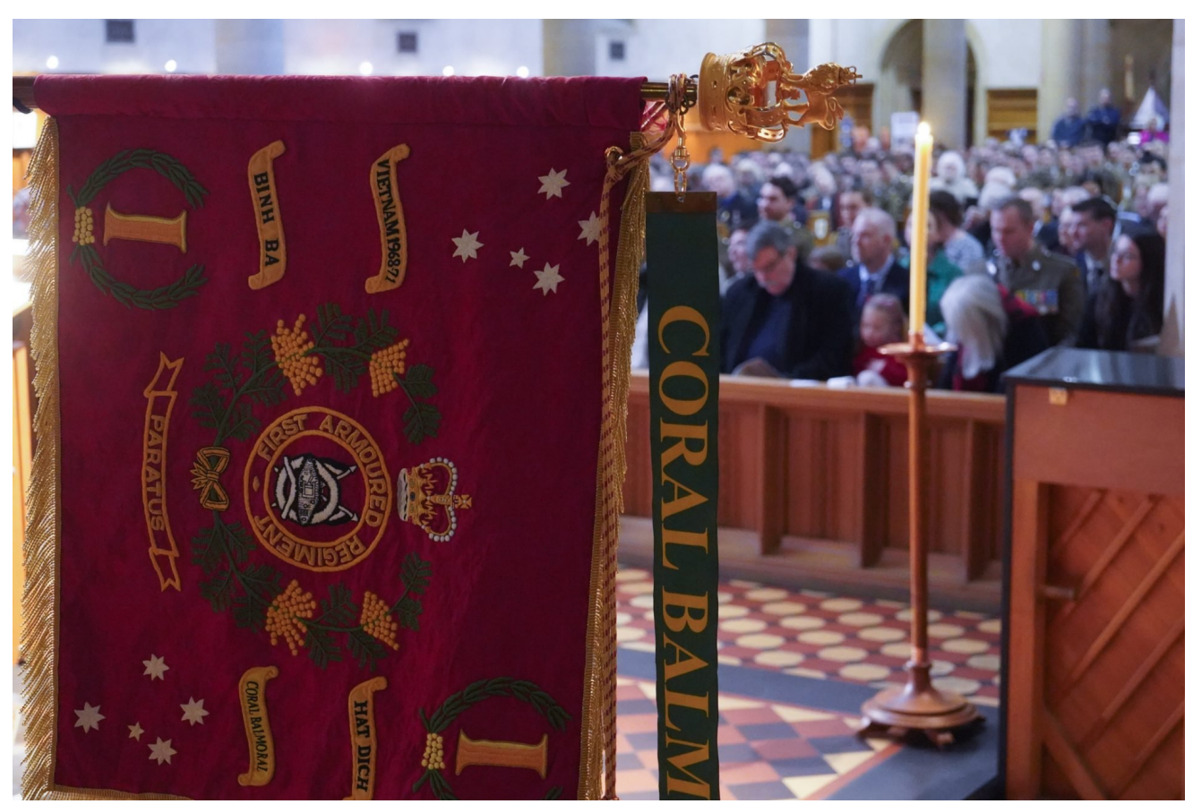
The Regimentâ??s standard on display during the service

â??The relocation of the Guidon and the first Standard enables the regimentâ??s current and former serving members to be physically closer to these sacred devices and reflect on their history,â?• the 9th Brigade wrote on Facebook.