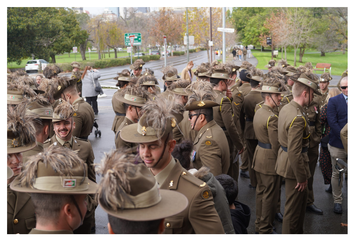
St Peterâ??s receives 1st Armoured Regimentâ??s standard for safekeeping

St Peterâ??s Cathedral today held a service to mark the relocation of the 1st Armoured Regimentâ??s Guidon (colours) and Standard from Lone Pine Chapel, Robertson Barracks, Northern Territory. They will remain on the altar for all to see for seven days before being hung permanently in the cathedral.