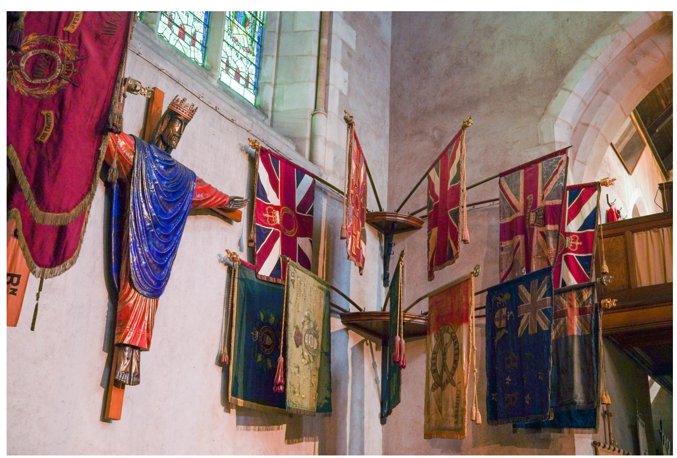
The Regimentâ??s Guidon will find its new permanent home here

For more than 121 years, the Cathedral has been a safe resting place for a number of Guidons, Standards, Colours and Banners â?? all distinctive forms of Honourable Insignia that are the symbol of the spirit of a regiment, for on them are borne the battle honours and badges granted to the unit in commemoration of gallant deeds performed by members of the unit from the time their unit was raised.