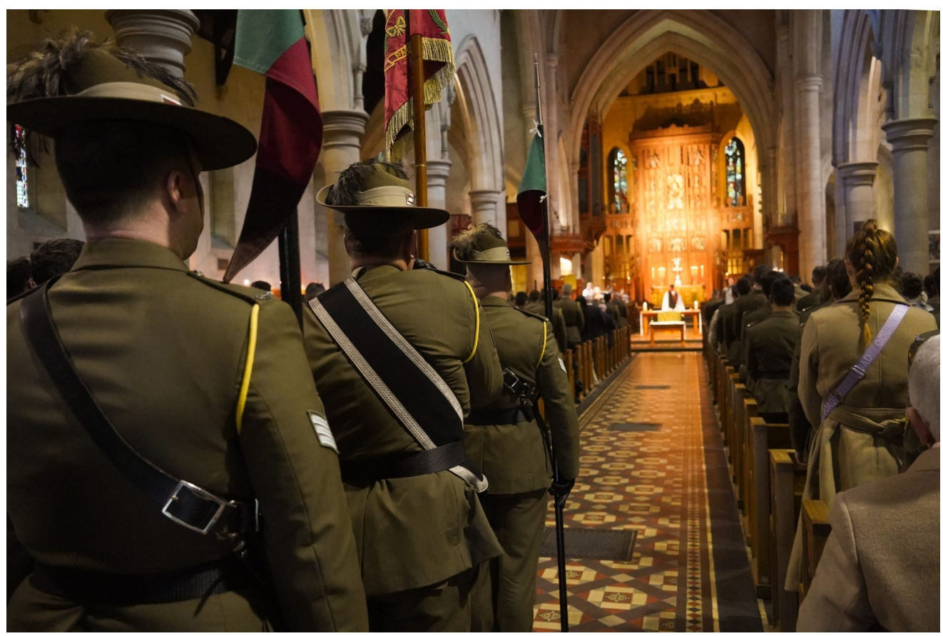
Preparing to march in the Standard