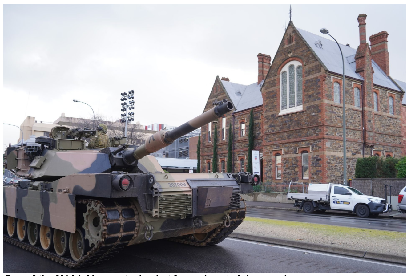
One of the M1A1 Abrams tanks that formed part of the march