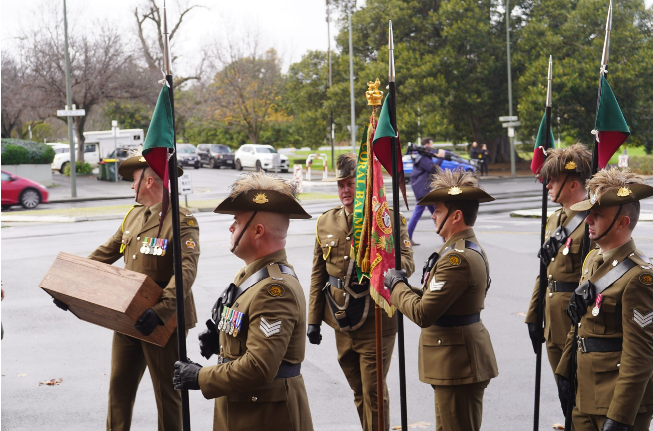
The honour guard brings the Guidon and Standard to the church