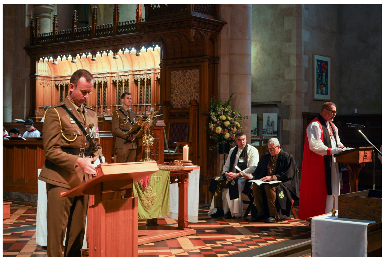
Preparing to receive the Guidon and Standard