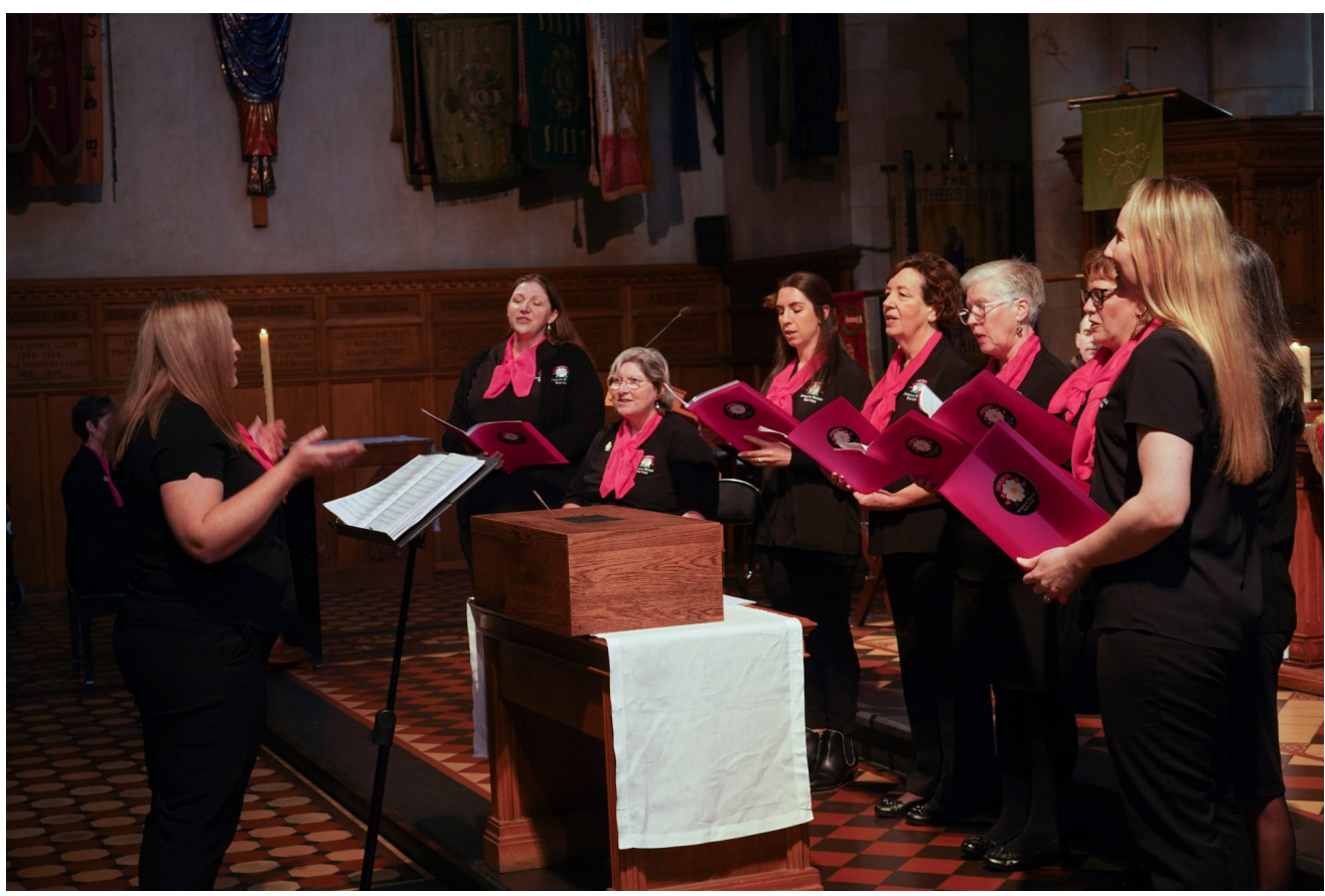
The Australian Military Wives Choir performs the anthem, The Call