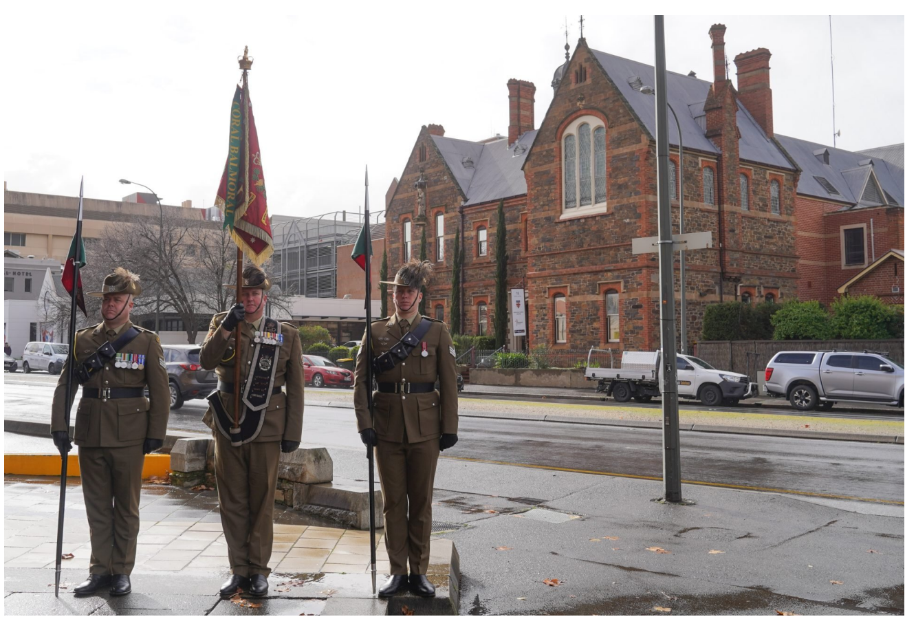
The honour guard outside the cathedral