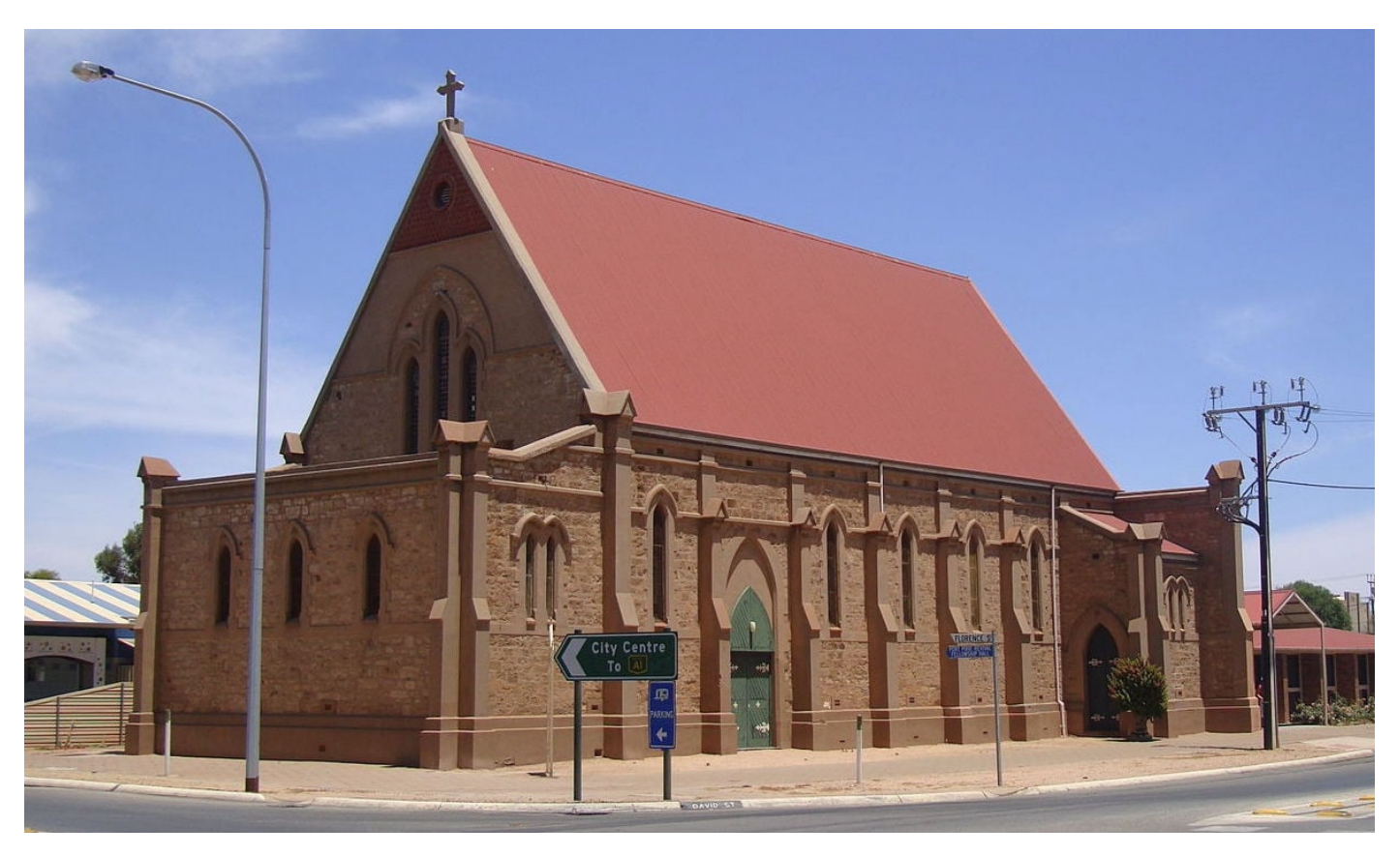
A new bishop for Willochra