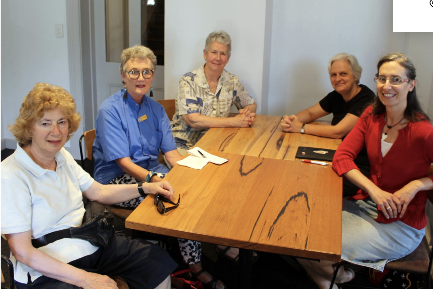
Anglican women on fundraising trek in NT