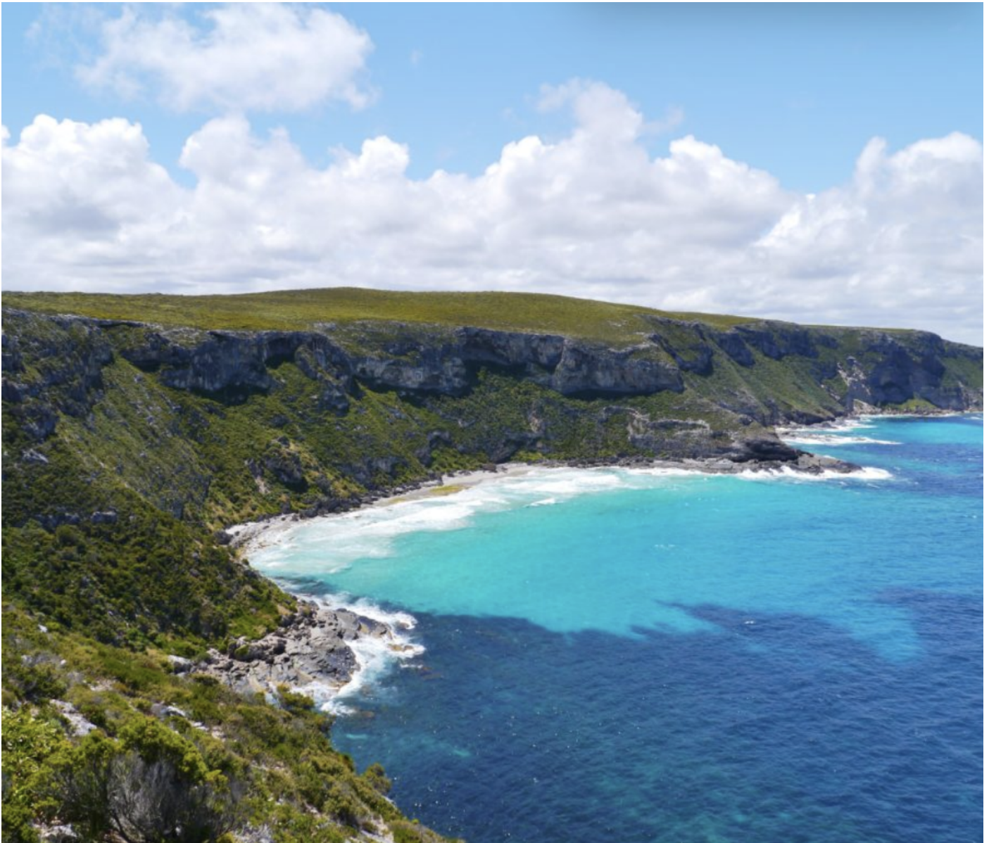
Letter from KI: Greener grass and enriched marriages after bushfires